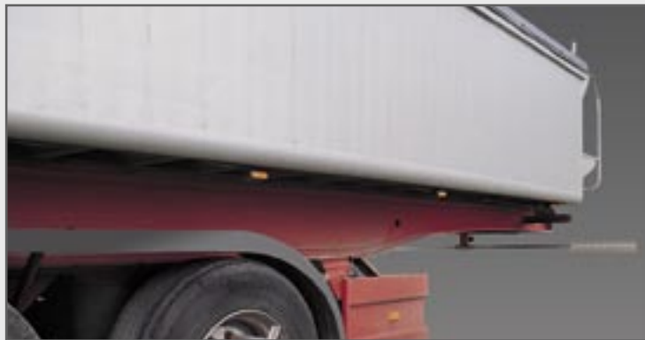
KAL-30 trailer measuring system