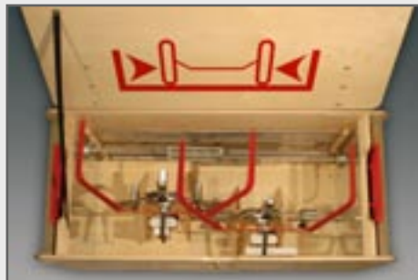
Storage box on wheels