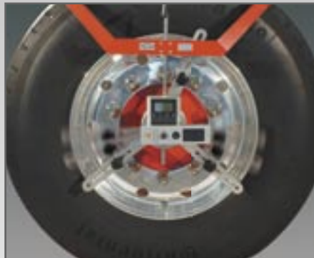
Swivel-mounted measuring arms