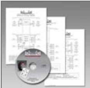
CD "measuring records"