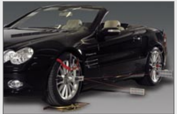
KPKW-30 adapter set for the measurement of cars and vans