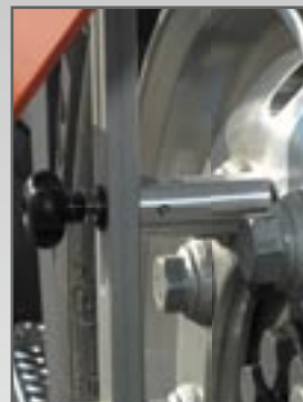
Adjustable measuring sensors