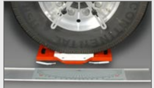
wheel plates, turning radius scales