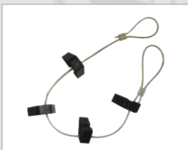
Magic bead pusher MBP

These optional extras are used in conjunction with MH 320 pro in order to handle run-flat tyre systems such as RFT, DSST, eufori@, SSR, ZeroP, EMT, etc.