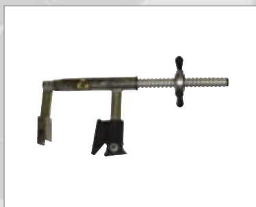
Bead depressor clamp