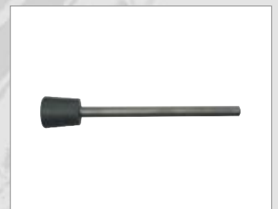
Second bar with roller